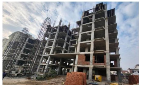
SITE PHOTOGRAPH (3 BHK APARTMENTS)