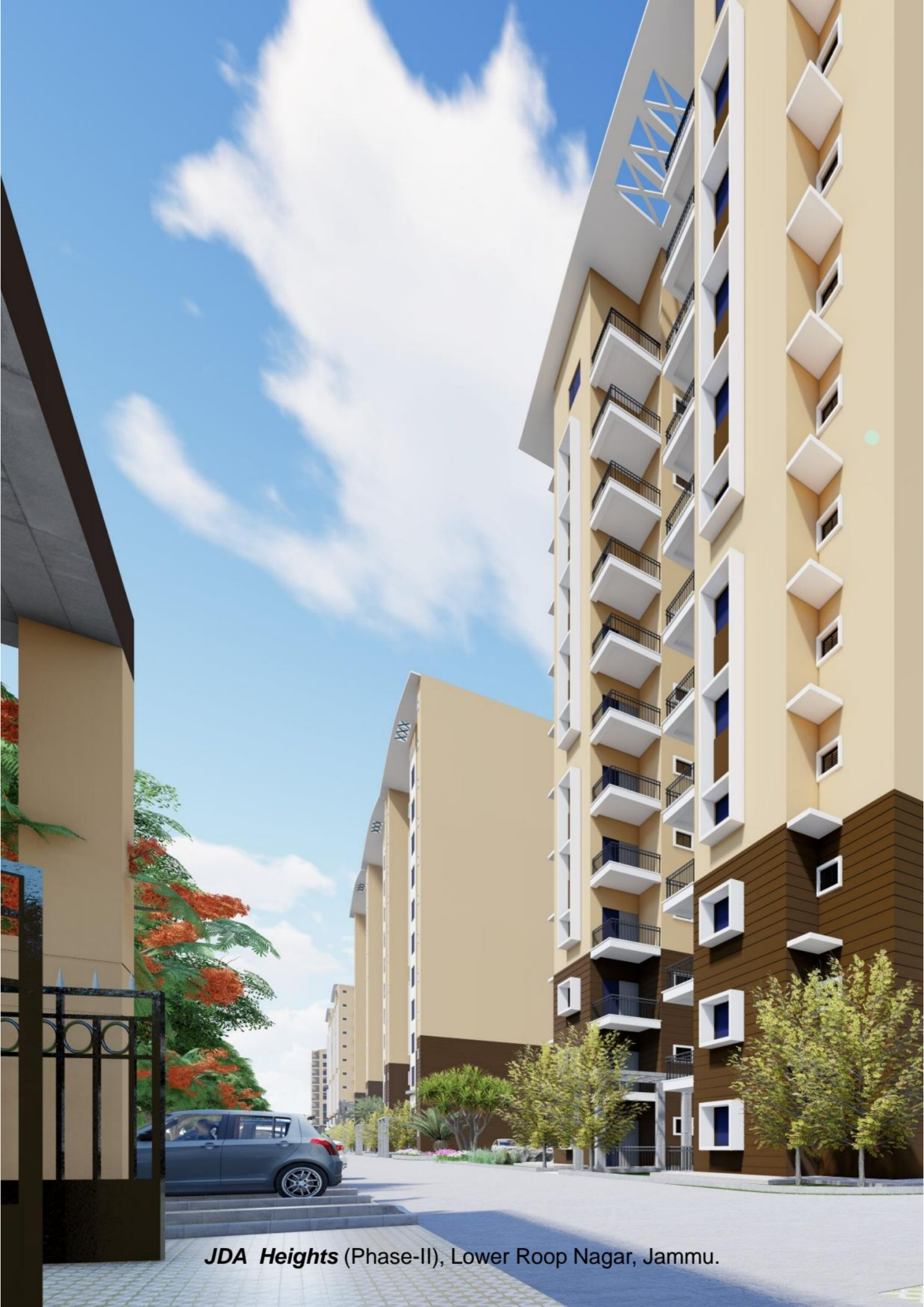
JDA Heights (Phase-II), Lower Roop Nagar, Jammu.