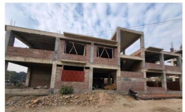
SITE PHOTOGRAPH (THE CLUB AND AMENITY BLOCK)

JDA Heights (Phase-II), Lower Roop Nagar, Jammu.