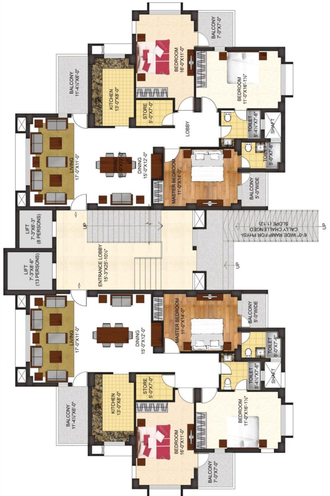
JDA Heights (Phase-II), Lower Roop Nagar, Jammu.