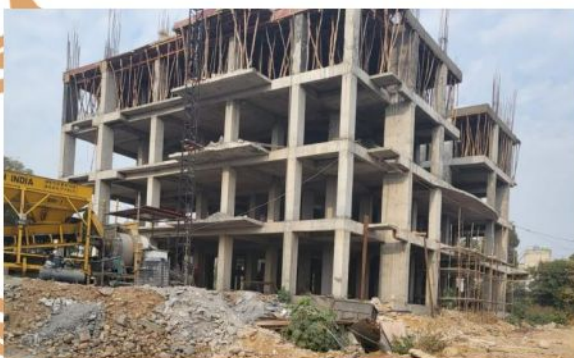
SITE PHOTOGRAPH (5 BHK APARTMENTS)