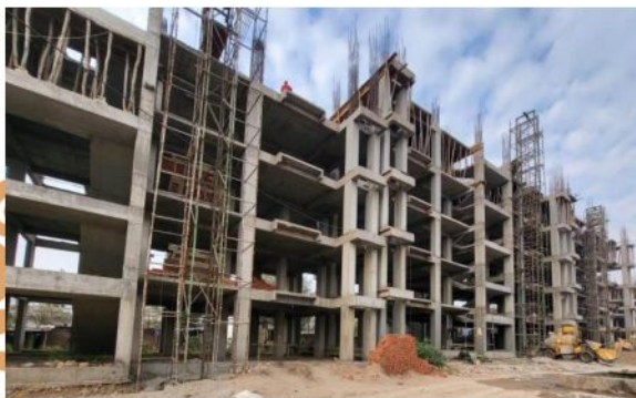
SITE PHOTOGRAPH (2 BHK APARTMENTS)